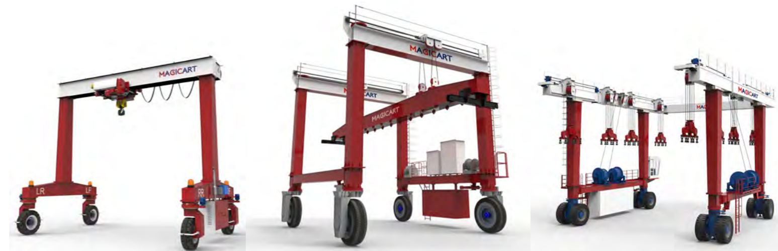
Mobile Gantry Crane series